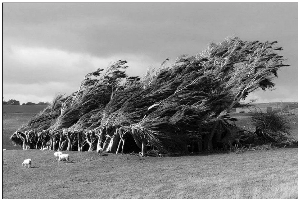
Figure 1. Performance poster for Really Actually Windy / R.A.W. Vol. 1 .

Could we rethink of technologies in a different way altogether? Do we hear too much about terror and violence, causing dizziness, vestibular disorders, tinnitus, and hyperacusis? Does this accelerated political “sensationism” (not quite foreseen by Fernando Pessoa’s claim that “ideas are sensations”) make us sick? 1 And what is it about listening (the aural) that has obsessed me lately, turning me toward different somatic places of investment in acoustic embodiment, other contingent sites, and away from the recent paradigm of immersive theatre and participatory social works? Are we not listening to other forces of things now—climates, atmospheres, heterotopias? And how does renting space connect to growing vegetables?