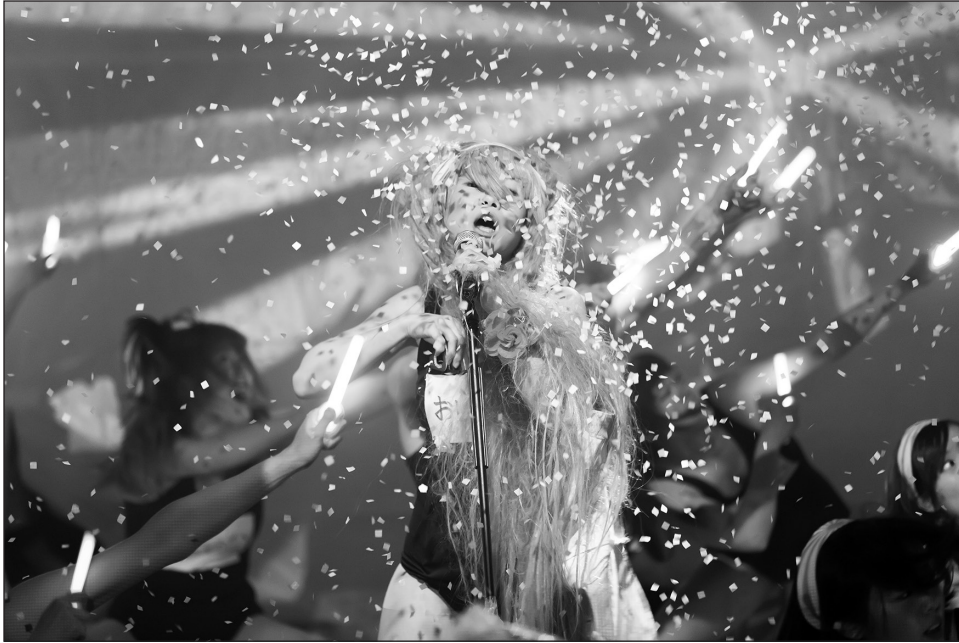
Figure 4. The company in Miss Revolutionary Idol Berserker .

During the 2016 edition of the Wiener Festwochen Festival, Oliver Frljić's Naše nasilje I vaše nasilje (Our violence is your violence) offers a similarly spectacular work of performance art, mixing dance, visual choreography, and electronic sound collaged into drastic physical theatre scenes that are meant to shock. Yet, the images here, including religious symbols and references to rape, torture, terror, fascism, and Islamophobia, evoke an almost old-fashioned sense of a bygone political theatre aesthetic. Frljić, who was born in Bosnia and now works as artistic director of the Croatian National Theatre of Rijeka, was commissioned by the Berlin HAU Hebbel Theatre/Wiener Festwochen to devise the performance as a critical homage to Peter Weiss's novel on radical resistance, Die Ästhetik des Widerstands (1975–81). He had previously provoked attention with his performances of Aleksandra Zec and Balkan macht frei (The Balkans set you free) (both 2015): the former dramatizing Croatian war crimes against a young Serbian girl and her family, the latter a more personal and intentionally stereotypical depiction of discriminatory policies present in every society. The main character in Balkan macht frei is Frljić's alter ego, performing his struggle to meet/overcome the expectations placed on him as a director coming from the Balkans.